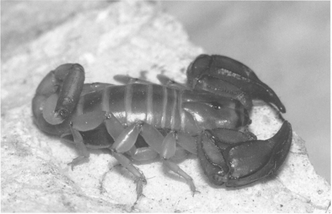
Fig. 5: Euscorpium carpathicus , Warmbad Villach.

thermophilic pine forests, stony subalpine meadows, stone walls, and castle hills with ruins.