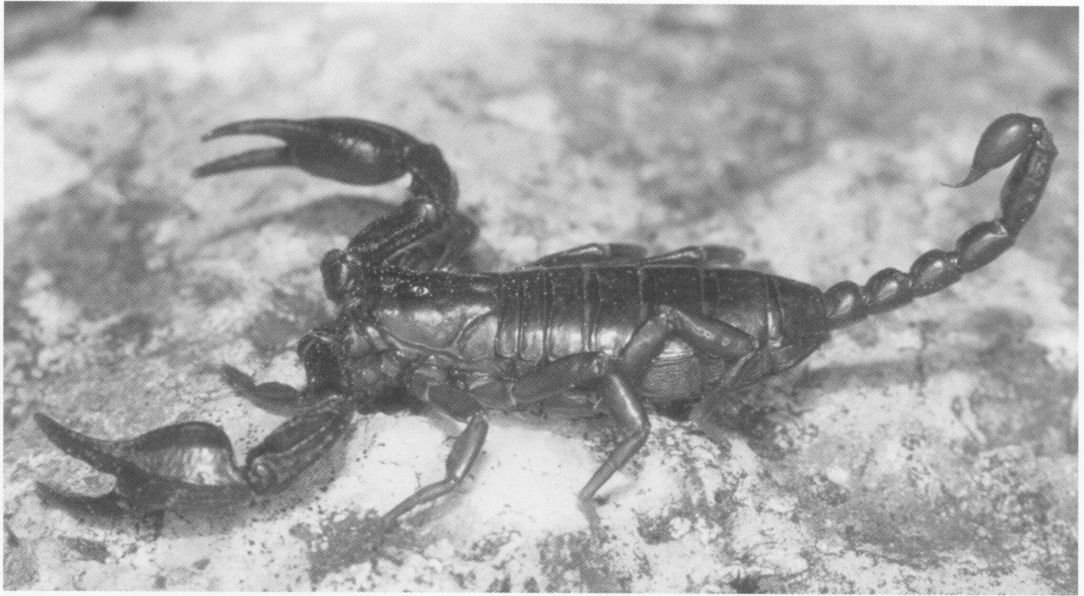
Fig. 3: Euscorpius germanus , Schütt/Dobrach.