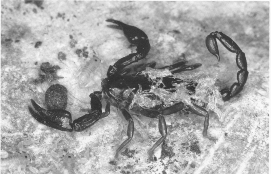
Fig. 4: Euscorpius gamma , Koschutabach/Karawanken.

In Austria, scorpions can be found under stones, in rock debris, under the bark of dead trees or stumps, and in leaf litter. Although they occur regularly in thermophilic habitats, a certain